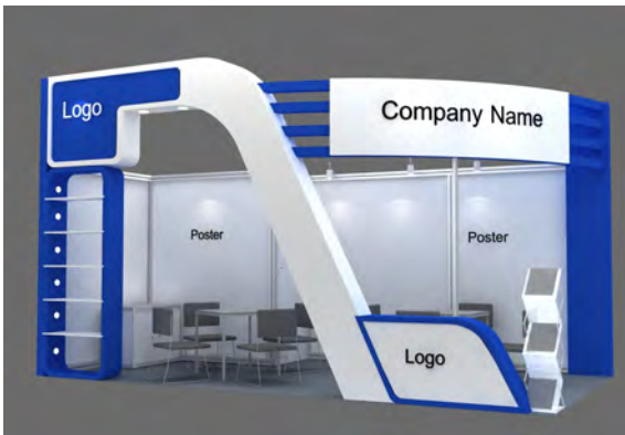
Design 4: EUR 144/m 2

The design may vary if the stand size or number of sides open differ.