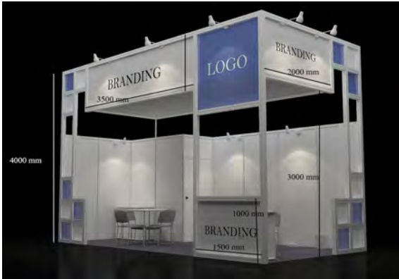
Design 3: EUR 85/m 2