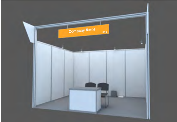
Design 1: EUR 40/m 2