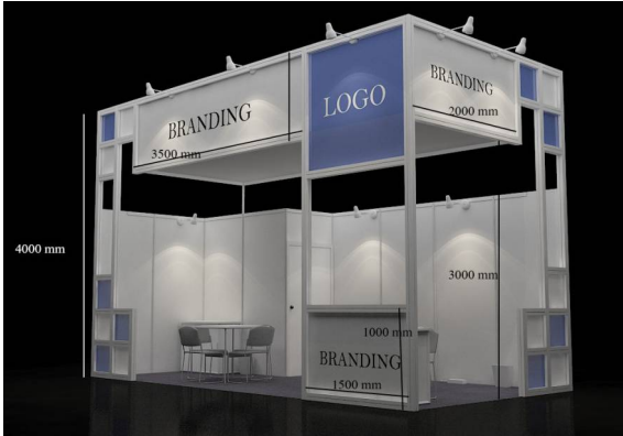
Design – 3: EUR 85/m 2