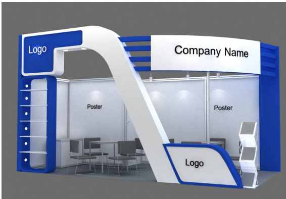
Design – 4: EUR 144/m 2