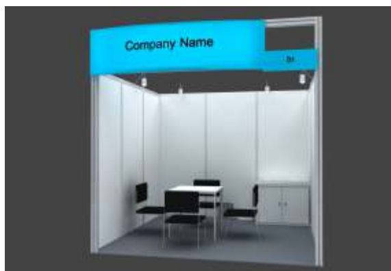
Design-2 - EUR 50/m 2

* The package includes 1 KW power supply per 9 m 2 .