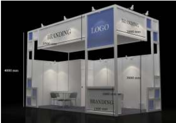
Design 3: EUR 85/m 2