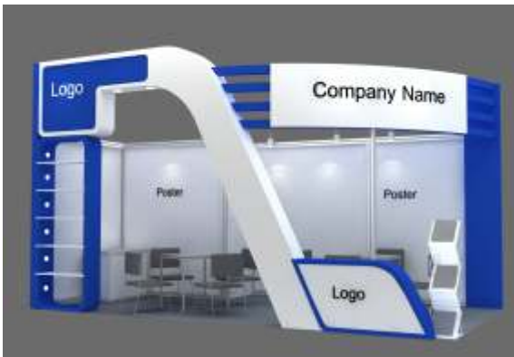
Design 4: EUR 144/m 2