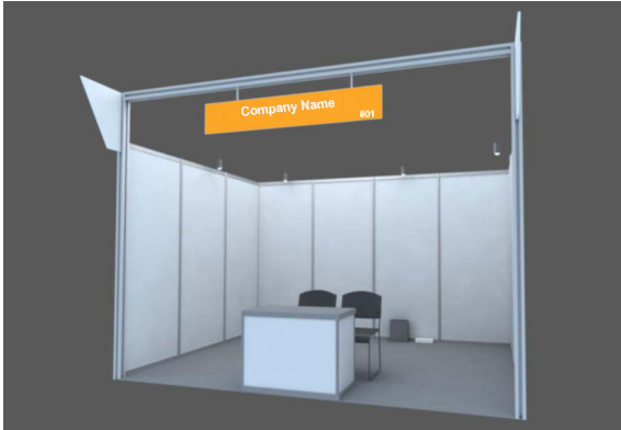
Design 1: EUR 40/m 2